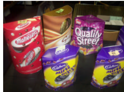
Some of the super prizes on offer