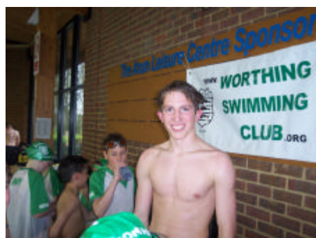
Swimmers from the Sussex League Gala

The next Rother League gala is on 25 th June, at Bognor Regis. We will be swimming against Elmbridge, Dorking, Sutton & Cheam, Fareham and Bognor Regis, all Division 2 clubs. For this gala the age groups change to U12, U14, U16 & Open.