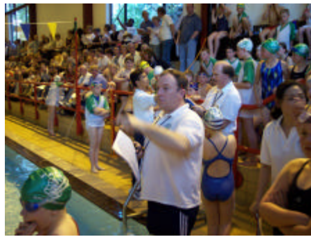
Action from the Age Groups