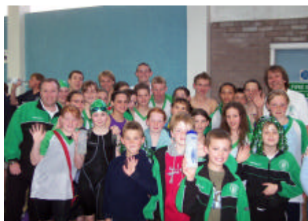
The Squad at Bracknell

The next Rother League gala is on 25 th June, at Bognor Regis. We will be swimming against Elmbridge, Dorking, Sutton & Cheam, Fareham and Bognor Regis, all Division 2 clubs. For this gala the age groups change to U12, U14, U16 & Open.