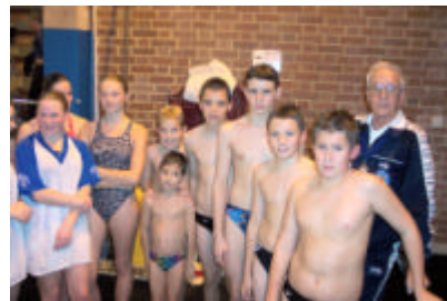
Worthing Diving Squad

Plain Diving Competition, Worthing 14 th November.